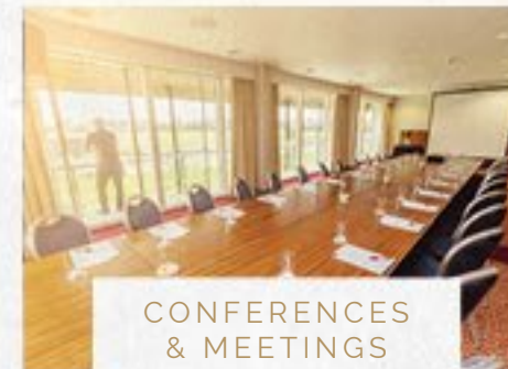
CONFERENCES & MEETINGS

Offering both shared and private Christmas party options. Whether you prefer an intimate indoor gathering or a lively outdoor event under the stars, our versatile spaces can be tailored to suit your celebration. Enjoy delicious festive menus, lively entertainment, and the unique atmosphere of the racecourse to create unforgettable memories.