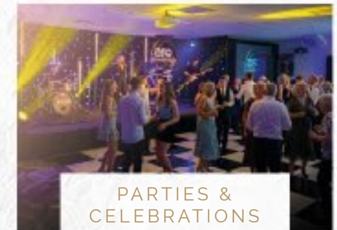
PARTIES & CELEBRATIONS

With versatile indoor and outdoor spaces Lingfield Park is perfect for exhibitions and fairs of all sizes. With excellent access, full facilities, and ample parking, it's ideal for trade shows, craft fairs, and large-scale events. Onsite catering is available for delegates and visitors, ensuring everyone stays refreshed and energized. Create engaging experiences and showcase your products in this dynamic and accessible venue.