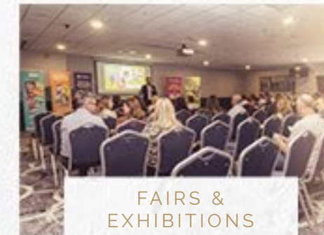
FAIRS & EXHIBITIONS

With around 20 stylish suites available, Lingfield Park Racecourse offers a flexible range of meeting and event spaces to suit every occasion. Whether you're hosting a small, focused board meeting or a large-scale conference, our venues cater to groups of all sizes with our specially designed Day Delegate Packages.